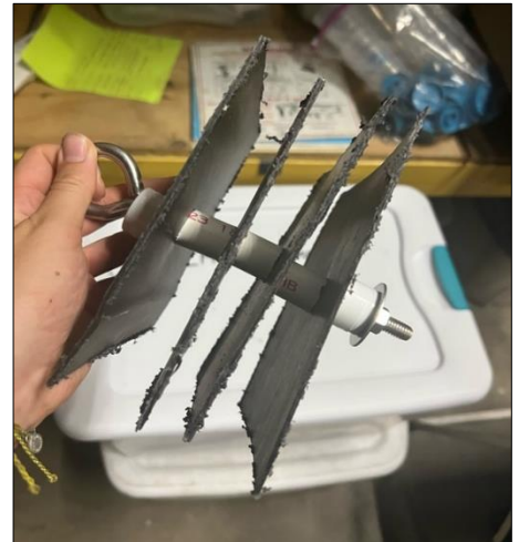
Figure 2. Vermont design sampler constructed with plastic trash can pieces, angled view.