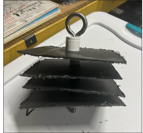
Figure 1. Vermont design sampler constructed with plastic trash can pieces.

Attach the three feet of rope to the eyehook to be suspended in water from docks and other objects.